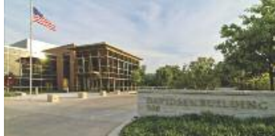
ACT headquarters in Iowa City.

ACT is an independent, not-for-profit organization that provides a broad array of assessment, research, information, and program management solutions in the areas of education and workforce development.